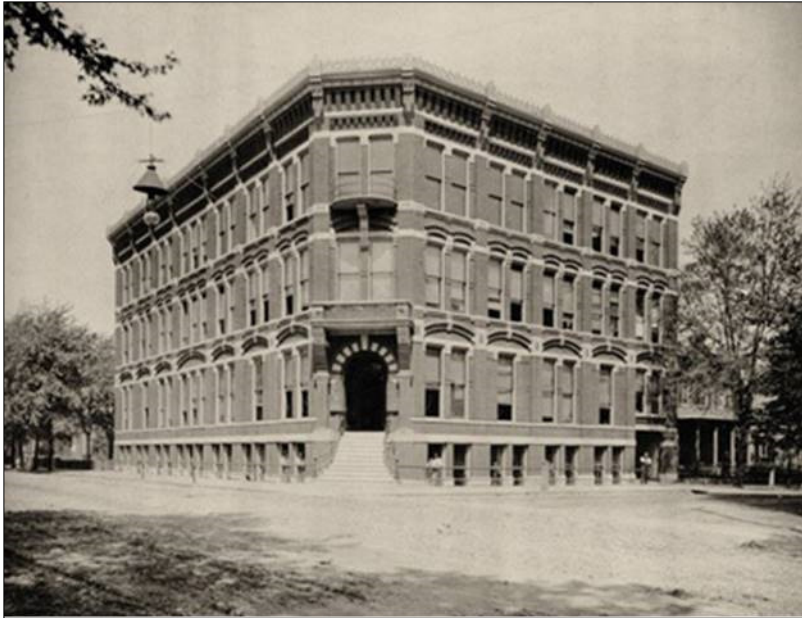
Farm and Fireside Block, located on the Northwest corner of High and Factory streets (now High Street and Wittenberg Avenue) in Springfield, Ohio.