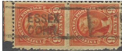
4.4644 long box roller