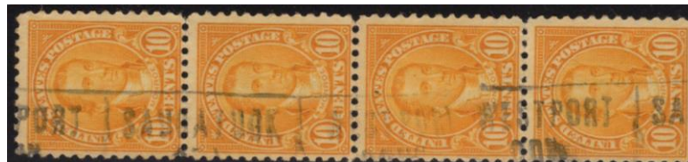
Alt Box Roller 6.46141 [WESTPORT / CONN] [SAUGATUCK / STA.]